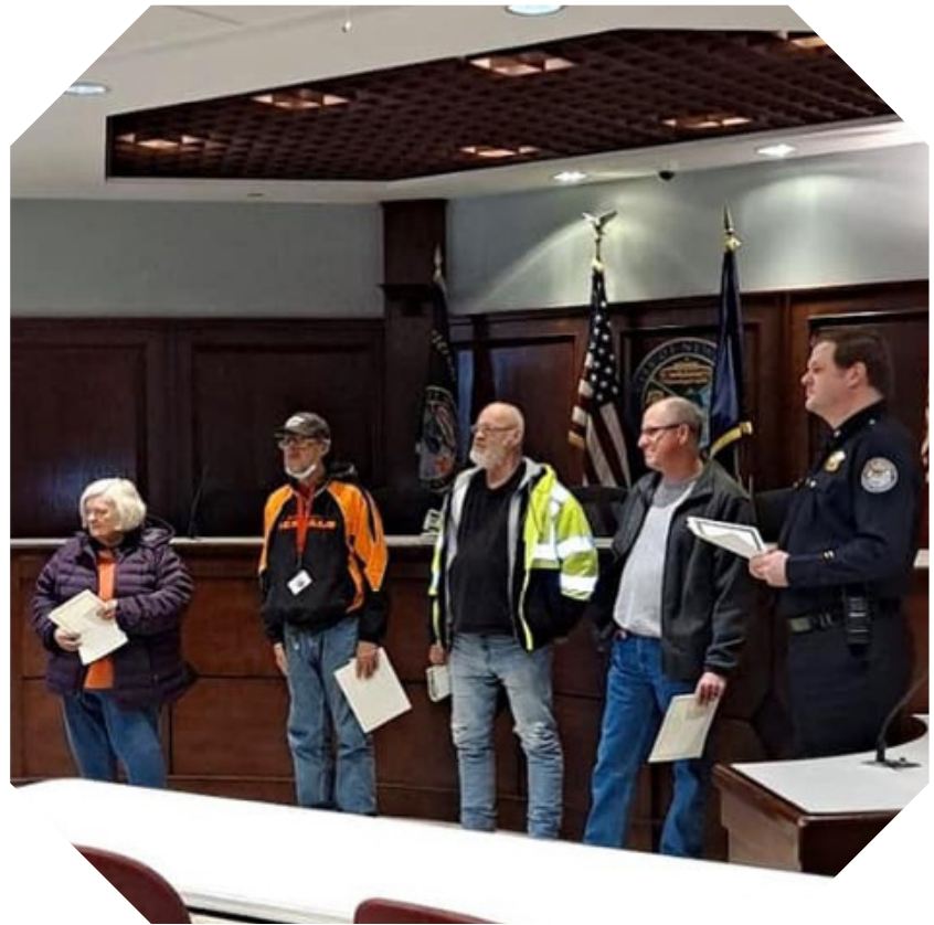
NPD appreciates the school crossing guards